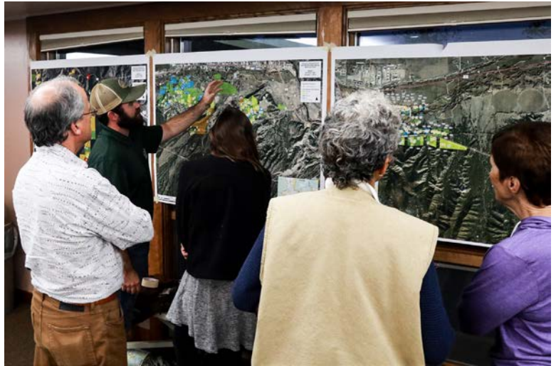
Figure 2. Colorado State Forest Service staff and community members in Chaffee County, CO attend a public meeting focused on revising the Chaffee County Community Wildfire Protection Plan.

and prioritize meaningful action to best prepare for wildfire impacts. These plans help communities more effectively endure wildfire incidents, recover from potential negative impacts in a more resilient fashion, and learn to live with inevitable wildfire more effectively. CWPPs are intended to be living documents, and they should be updated over time to adapt to dynamic social and natural environments.