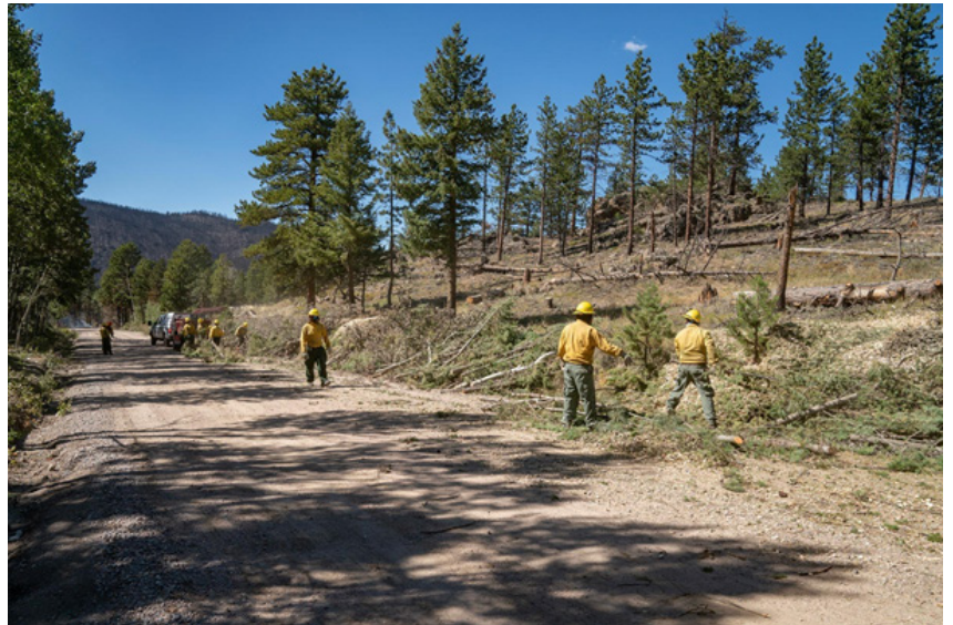
Figure 4. Roadside clearing and brushing to make the road defensible. This work along POD boundaries improves its potential for control.

PODs boundaries represent the best control features that already exist on the landscape, but these boundaries are not necessarily equally effective, especially under extreme conditions. Fuel treatments can be strategically placed along POD boundaries to strengthen them and improve their likelihood of containing a fire, especially in important areas or adjacent to values at risk. Further, in some cases fuel treatments can be constructed in other locations in order to break up PODs into smaller areas, providing more opportunities for suppression and community protection during a wildfire.